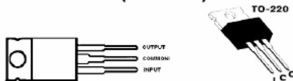
KC PACKAGE (TOP VIEW)

This series of fixed-voltage monolithic integrated-circuit voltage regulators is designed for a wide range of applications. These applications include on-card regulation for elimination of noise and distribution problems associated with single-point regulation. Each of these regulators can deliver up to 1.5 amperes of output current. The internal current limiting and thermal shutdown features of these regulators make them essentially immune to overload.