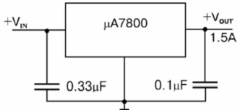
Fig. 1. Positive Regulator

For a positive regulator, a 0.33- \mu\text{F} bypass capacitor should be used on the input terminals. While not necessary for stability, an output capacitor of 0.1 \mu\text{F} may be used to improve the transient response of the regulator. These capacitors should be on or as near as possible to the regulator terminals. See Fig.1.